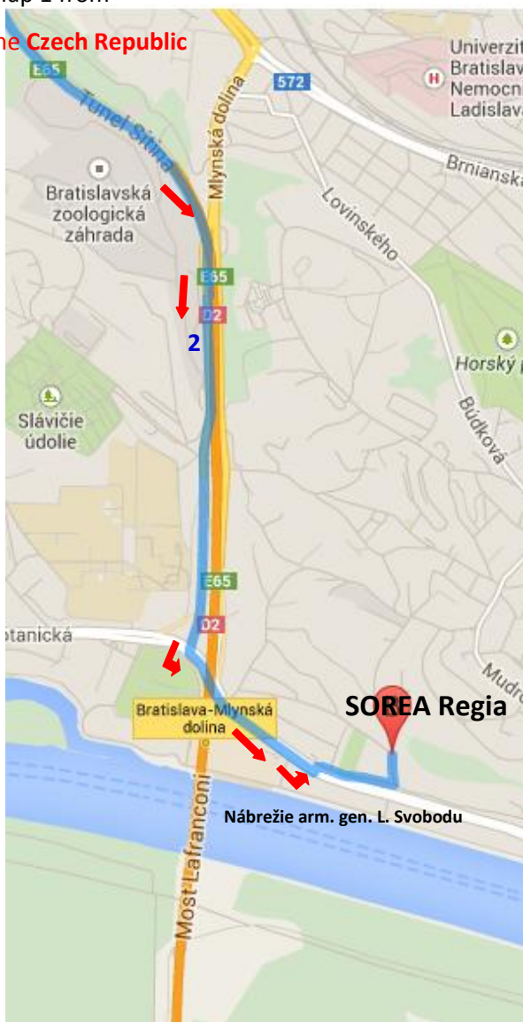
Map 1 from the Czech Republic