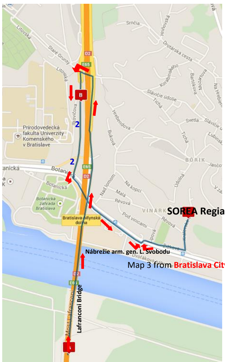
Map 2 from Vienna - Schwechat